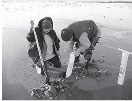
Call before you dig! Shellfish harvest hotline: 503-986-4728.

Domoic acid is a relatively new toxin and has recently appeared along the west coast of the United States and Canada. Domoic acid is produced by the diatom Pseudo-nitzschia . The first reported outbreak of domoic acid poisoning